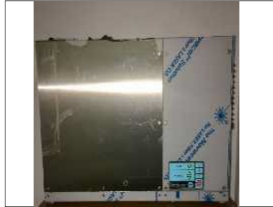
Figure 4.1. Air Sniper Pro air cleaner photographed at airmid healthgroup

Three Air Sniper Pro air cleaners were received in airmid healthgroup on August 18 th 2016 for testing in the environmental testing chamber.