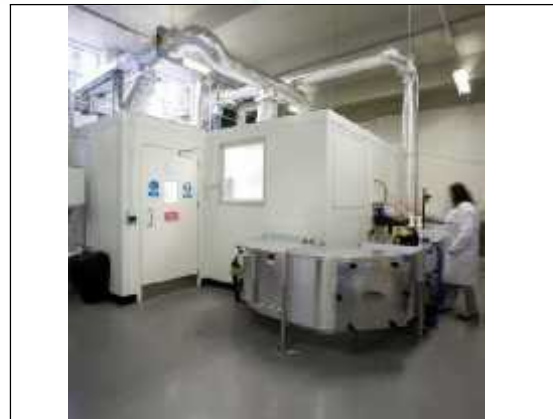
Figure 5.1. Environmental Testing Chamber

The ATSM Environmental Testing Chamber maintains selected temperature and humidity levels over a range of 0.38 to 30.0 air changes per hour. It is constructed from stainless steel with all materials complying with low VOC (Volatile Organic Compounds) emission requirements.